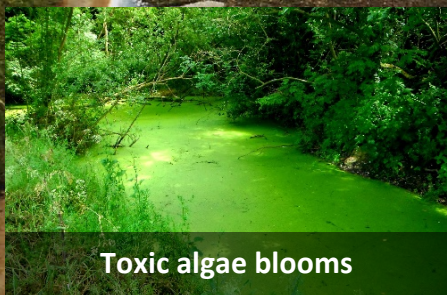
Toxic algae blooms